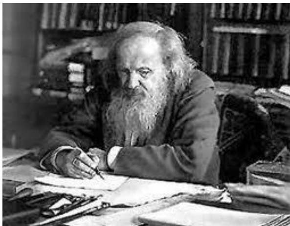
Dmitri Mendeleev (1834-1907).

The periodic table was first suggested by a Russian chemist Dmitri Mendeleev in 1869. He found that if the chemical elements are arranged according their atomic mass, their chemical properties exhibit periodicity, that is why it is called “periodic”.