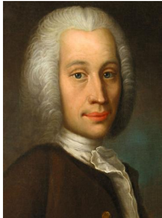
Anders Celsius (1701-1744)

Zero point of the Celsius scale, named after Swedish astronomer Anders Celsius (1701-1744) corresponds to the temperature of melting ice, temperature of hundred degrees corresponds to the temperature of boiling water. To recalculate Fahrenheit temperature into the Celsius temperature we have: