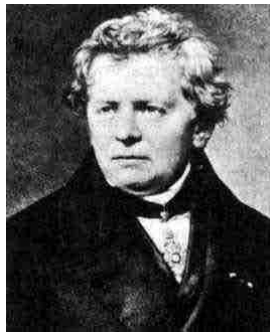
Georg Simon Ohm (1789_1854)

The resistance is measured in Ohms. This unit is named after Georg Simon Ohm, German physicist and high school teacher.