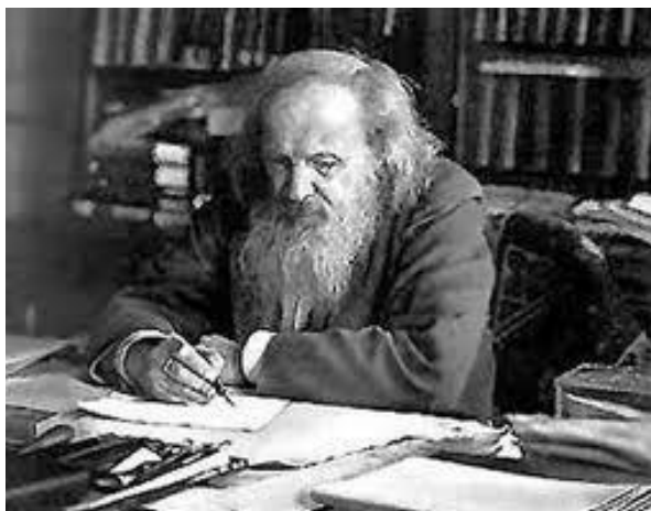
Dmitri Mendeleev (1834-1907).

The periodic table was first suggested by a Russian chemist Dmitri Mendeleev in 1869. He found that if the chemical elements are arranged according their atomic mass, their chemical properties exhibit periodicity, that is why it is called “periodic”.