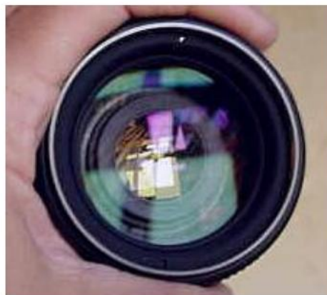
Figure 3. AR coating

If the waves reflecting from both sides of the film interfere destructively (cancel each other), then most of the incident light goes through the film. So thin transparent film can reduce light reflection from, say, objective of the camera, which makes the camera more sensitive. Such film is called antireflection (AR) coating.