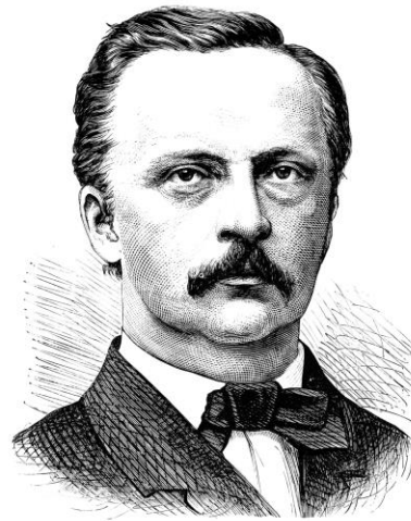
Hermann Ludwig Ferdinand von Helmholtz (1821-1894)

Julius Robert von Meyer (1814 – 1878), German physician and physicist whose name is associated with the first formulation of the energy conservation law. Famous Japanese physicist, Ryogo Kubo describes the discovery of Julius Meyer as follows: