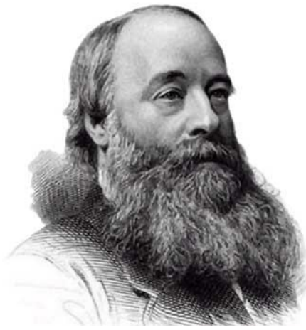
James Prescott Joule (1818-1889)