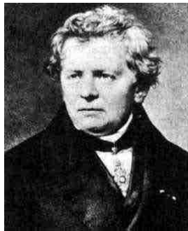
Georg Simon Ohm (1789_1854)

The resistance is measured in Ohms. This unit is named after Georg Simon Ohm, German physicist and high school teacher.