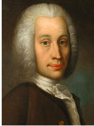
Anders Celsius (1701-1744)

Zero point of the Celsius scale, named after Swedish astronomer Anders Celsius (1701-1744) corresponds to the temperature of melting ice, temperature of hundred degrees corresponds to the temperature of boiling water. To recalculate Fahrenheit temperature into the Celsius temperature we have: