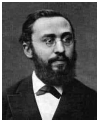
Hendrik Antoon Lorentz (1853-1928)

Magnetic force, described by formula 1, is also called Lorentz force. This name is given after a Dutch physicist Hendrik Antoon Lorentz..