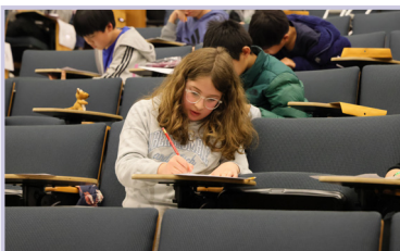
Math Kangaroo 2024

"I participate in Kangaroo not because my parents make me, I do it of my own will and I do it of my own will because I know doing the questions will make me smarter, more observant, and better at reading comprehension. While becoming smarter is a part of it, I do Kangaroo for the thrill, and to make me happy with what score I get, good or bad. It pushes me to be better and work harder. These are some reasons I do Kangaroo."