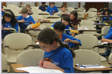
Math Kangaroo 2010

"I loved Math Kangaroo because it was a fun introduction to math competitions for me. My SchoolNova teachers would put a few Math Kangaroo style problems in our homework every week to prepare us so I didn't feel too nervous or stressed, and it was fun to get the T-shirts and other goodies and see all my SchoolNova classmates on a different day of the week."