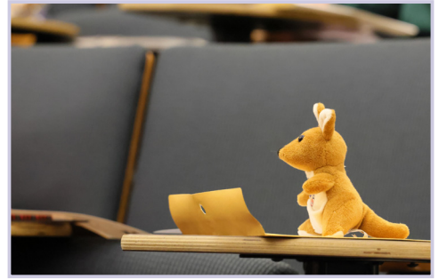
Toy mascot of the competition

#5: Over the years, the Math Kangaroo became the largest math contest in the world, with over 6 million participants worldwide.