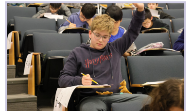
Math Kangaroo 2024