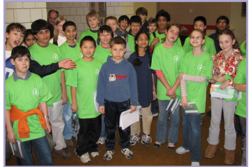
Math Kangaroo 2007