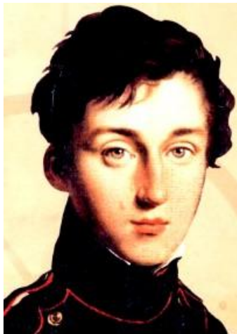
Sadi Carnot (1796-1832)

This cycle describes the operation of a theoretical engine which is called Carnot engine. It is named after French engineer Sadi Carnot.