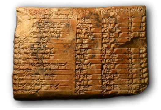
Babylonian mathematical tablet Plimpton 322.

Another very well-known numeral system is the Roman system; it was used for thousands of years and, in some cases, is still used today as well. It's a "decimal", 10-based system, but the symbols (letters) are used in an unusual way.