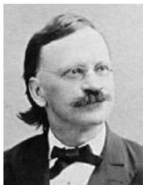
Edward Morley (1838-1923).

As it was believed, the ether is a substance which penetrates the universe and is the medium for the propagation of light like, say, air is the medium for the sound waves. The motionless ether provides a good reference frame to register the motion of Earth. Assuming the velocity addition rule from classical mechanics the scientists expected to detect the difference in the speed of light propagating along and perpendicular to the direction of the Earth motion. A.A. Michelson invented the optical interferometer – very sensitive device which made such detection possible.