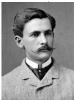
Albert Michelson (1852-1931).

As we discussed light as waves, there was a question: is there the media which “produces” light waves like water “produces” the waves on the water surface and air “produce” sound waves? In the end of 19 th century the physicists believed that such a media exists and called it “luminiferous ether”. As long as the Earth moving in space, theoretically we could measure the speed of the Earth with respect to the ether. To check this assumption, Albert Michelson and Edward Morley in 1887 performed their famous experiment in an attempt to register the motion of Earth through the ether by optical methods.