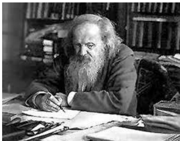
Dmitri Mendeleev (1834-1907).

Only two of the chemical elements – mercury and bromine - are liquids at normal conditions ( T=300\text{K} , atmospheric pressure), eleven elements are gases. The other elements are solids except nine elements (109-111 and 113-118) in the end of the table whose chemical properties are still unknown. The most important parameter which determines chemical properties of an element is the atomic number Z . The atomic number is the number of protons in the atomic nucleus.