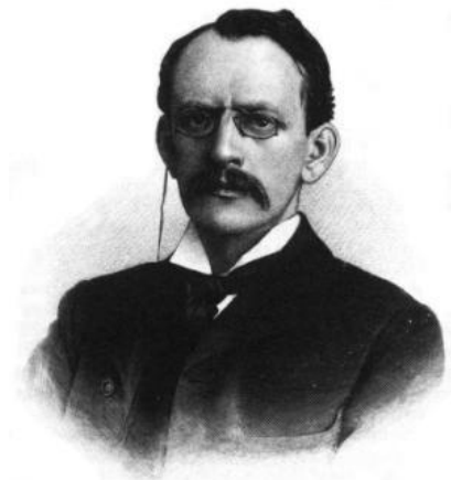
Joseph John Thomson (1856-1940).

Electromagnetic forces, second strongest force in nature, play a crucial role in the world which surrounds us. As we know, the atoms exist due to electrical attraction between negatively charged electrons and positively charged protons in the atomic nuclei. The idea about small particles which are “the nature’s building blocks” for all the objects around us appeared very long time ago in ancient Greece and India. First subatomic particle, electron, was discovered by British physicist J.J.Thomson in 1897.