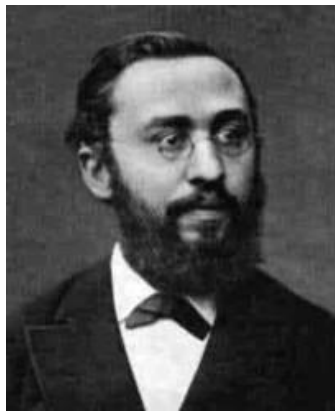
Hendrik Antoon Lorentz (1853-1928)

Magnetic force, described by formula 1, is also called Lorentz force. This name is given after a Dutch physicist Hendrik Antoon Lorentz..