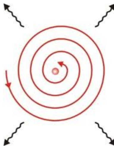
Figure 2: A death of the "Rutherford atom".

What does it mean in a context of the Rutherford model? That means the electron rotating the nucleus would be constantly emitting electromagnetic waves (i.e. light, UV radiation, etc) and, since the emitted light would carry part of electron's kinetic energy, its