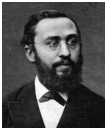
Hendrik Antoon Lorentz (1853-1928)

Magnetic force, described by formula 1, is also called Lorentz force. This name is given after a Dutch physicist Hendrik Antoon Lorentz..