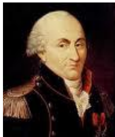
Charles Augustin de Coulomb

Here Q and q are the charges of the objects; r is the distance between them. The charge is measured in Coulombs (C). This name is given after a French physicist Charles Augustin de Coulomb (1736-1806).