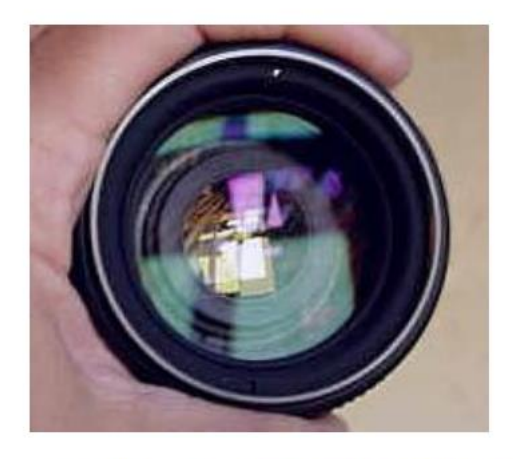
Figure 3. AR coating

If the waves reflecting from both sides of the film interfere destructively (cancel each other), then most of the incident light goes through the film. So thin transparent film can reduce light reflection from, say, objective of the camera, which makes the camera more sensitive. Such film is called antireflection (AR) coating.